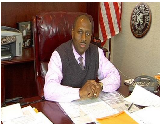
The Mayor of Orange Township working hard to help the City of Orange virtually.

The job of being the mayor is already difficult enough, but during a pandemic, it becomes increasingly difficult. Mayor Dwayne D. Warren, Esq., the Mayor is the Chief Executive of The City of Orange Township sat down with The Oakwood Times journalists and spoke about what it has been like to help the city of Orange, virtually.